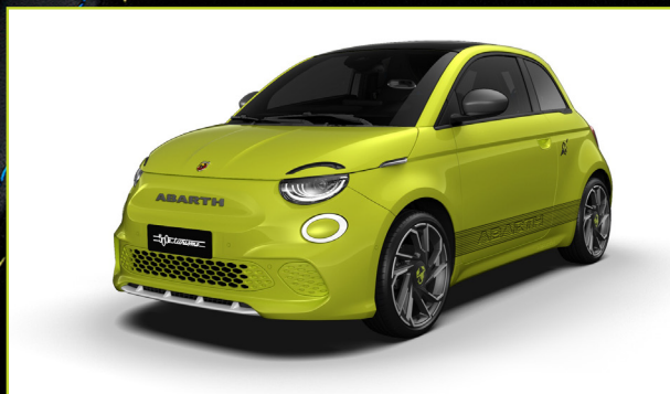
878 Acid Green Abarth 500e