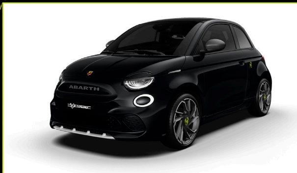
601 Venom Black Abarth 500e