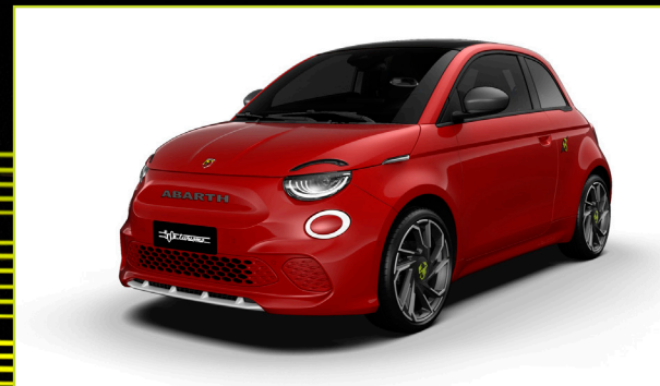
111 Adrenaline Red Abarth 500e