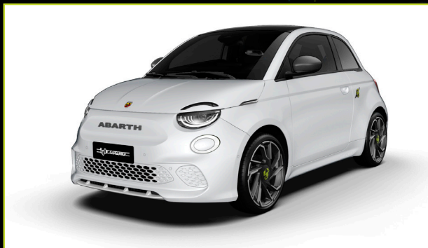
268 Antidote White Abarth 500e