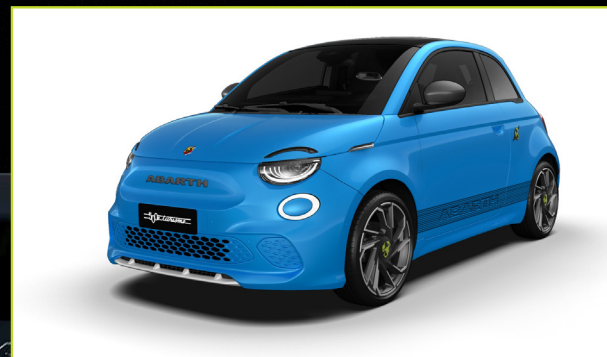
877 Poison Blue Abarth 500e

Note: Acid Green and Poison Blue do not feature decals